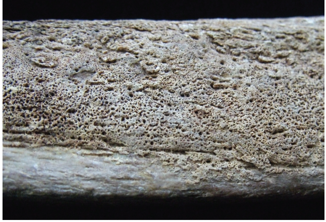
Figure 6. Periosteal new bone formations on the diaphysis of the left tibia (Grave no. 6).

The endocranial changes observed may refer to increased intracranial pressure possibly due to meningeal reactions induced by intrathoracic infection, particularly TB (Schultz