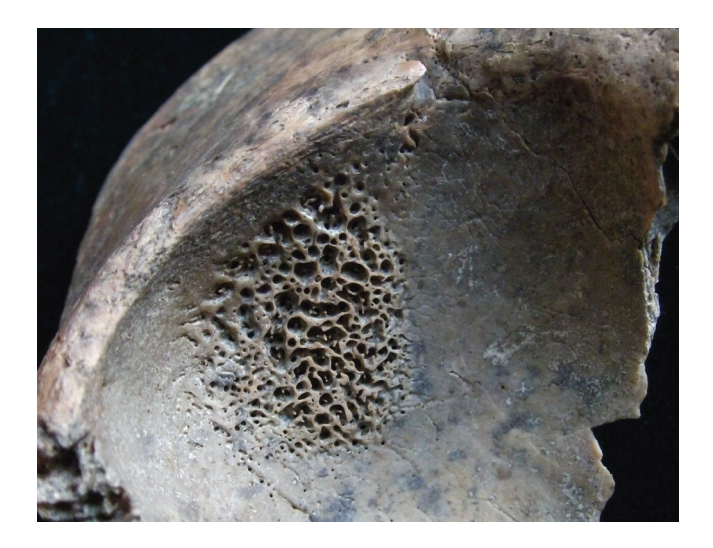
Figure 4. Cribrotic cribra orbitalia of the right orbit (Grave no. 5).

of the frontal bone, most pronounced on the left side, along the sutura coronalis (Fig. 3). Moreover, the internal surface of the parietal bones showed small abnormal blood vessel impressions. The skeleton also exhibited stress indicators: traces of slight periosteal new bone formation on the anterior and posterior aspect of mandible and cribrotic cribra orbitalia of the right orbit (Fig. 4) accompanied the alterations mentioned above.