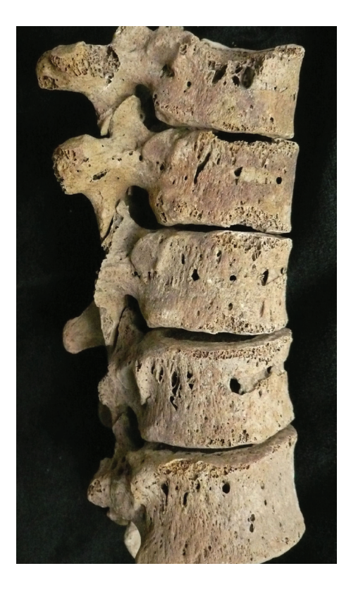
Figure 12. Signs of hypervascularisation on the lateral aspect of the thoracic vertebral bodies (Grave no. 13).