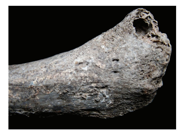
Figure 8. Cystic lesion on the sternal end of the right clavicle (Grave no. 6).

sacrum showed a circular, 17x16 mm lytic lesion accompanied by remodelled, reactive new bone formation (Fig. 10) probably in response to an overlying cold abscess.