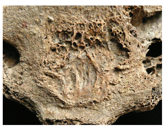
Figure 10. Traces of probable cold abscess on the ventral surface of the sacrum (Grave no. 6).

revealed in the form of multiple, smooth-walled resorptive pits on the anterior and lateral surfaces of the lower thoracic vertebral bodies (from T8 to T11) (Fig. 11 and 12). These lesions sometimes appeared interconnected with wide, horizontal superficial vascular channels. In this skeleton, extravertebral pathological changes were also observed. Both tibiae presented evident signs of periostitis: the surface of the cortex was pitted and longitudinally striated (Fig. 13) along the shaft. In spite of the poor state of preservation, very subtle periosteal appositions were noted on the visceral surface of two rib fragments. The alterations appeared near the angulus costae.