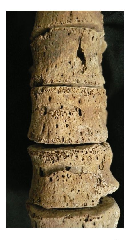
Figure 11. Resorptive lesions on the anterior aspect of the thoracic vertebrae (Grave no. 13).