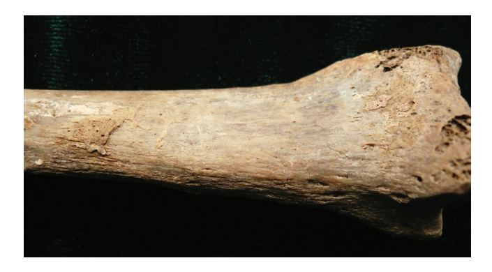
Figure 7. Osteo-periostitis on the distal part of the right radius (Grave no. 6).