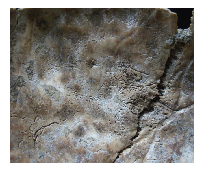
Figure 5. Signs of widespread periostitis in the right femur (Grave no. 6).